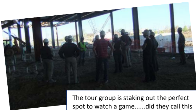
The tour group is staking out the perfect spot to watch a game.....did they call this the rowdy section?

The team of superintendents has their work cut out for them with an international soccer match already on the calendar. The schedule has driven creative project management with multiple subcontractors performing work on different levels, 2-shift work, and intense site coordination. With a design almost totally focused on the spectator experience, the tour group agreed that a return trip to see a game in the completed facility was in order. Watch the calendar in 2011 for a chance to compare the before photos to the real thing.