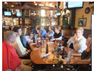
Happy hour after the tour at Wild Bill's at The Legends. Props to the accountants for closing the event down!